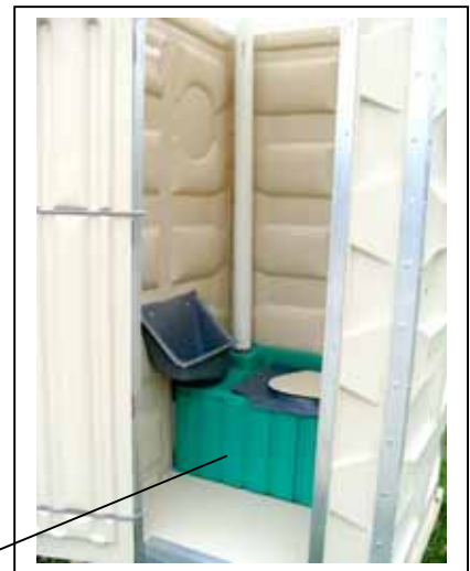
Front View of Flip Top Tank

Toll-Free Phone: 800-521-6310 International Phone: 001-586-739-4611 Fax: 001-586-731-0670 E-Mail: info@toilets.com Web Page: http://www.toilets.com