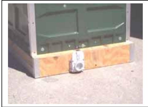
Dump Valve Model