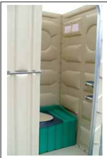
Made From Recycled Materials