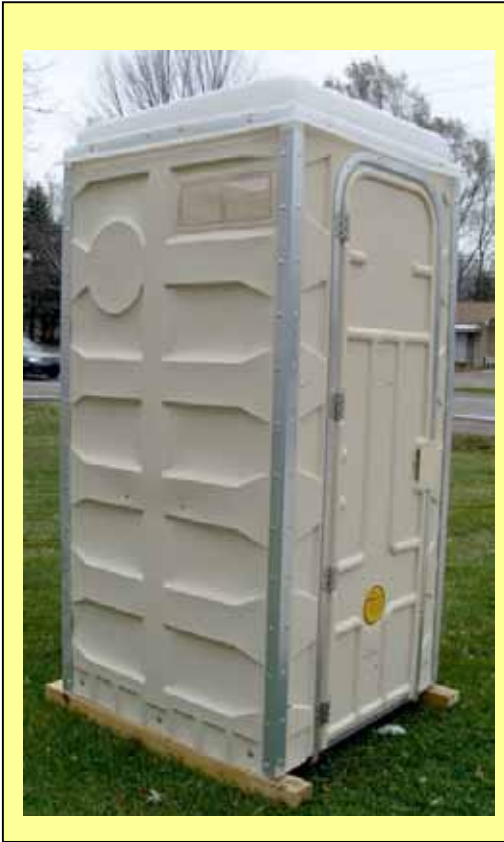
Our Most Popular Model