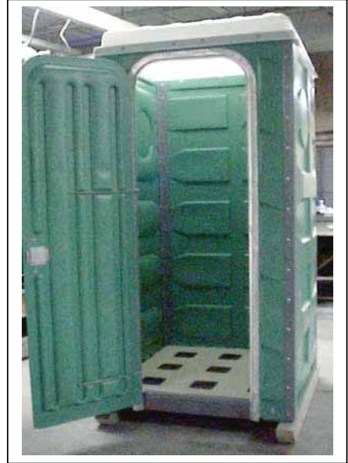
Flat Floor Model