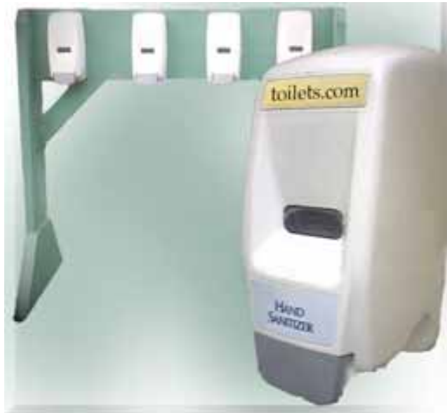
Hand Sanitizer Station