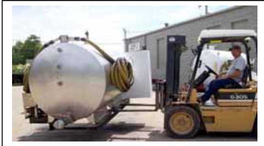
900 Gallon Waste Tank 300 Gallon Chemical Tank

Pump From Both Sides - Power Wash From Both Sides - Draw Chemical From Both Sides