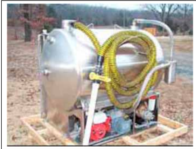
Stainless Steel Tank + Tiger Tail Hose