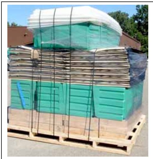
12 Complete Model FPT 300 Ready to Ship