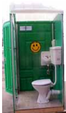
Fig. 4 - Model SJ 520