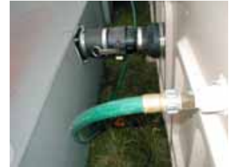
Comfort Station Hook Up