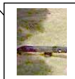
Sewer or Septic Tank Hook-up