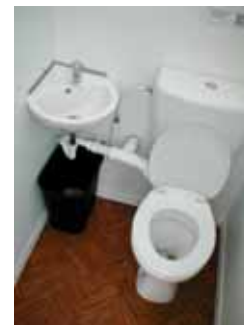
Fig 5 - Model 600