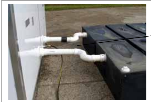
Holding Tank and Garden Hose Connection