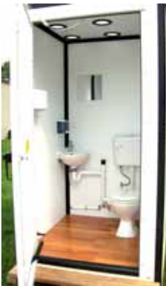
Fig. 3 - Model 4848