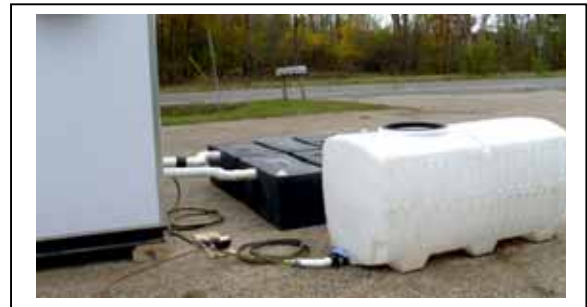
Holding Tank With Pressurized Water Tank