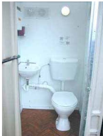
Model SJSPCS 600 Ceramic Bowl & Sink Finished Interior Walls