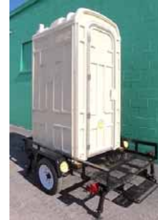
SJHD 450T Internal Sink

Model SJHD 450IS With Sinks Dimensions: 44" x 44" x 89" 68 Gallon (257L) Holding Tank 12 Gallon (48L) Sink