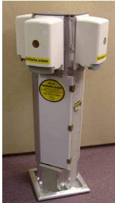
Portable – Can Be Anchored to Wall or Ground