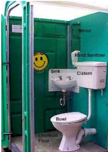
Model SJSDCS 520 Ceramic Bowl & Sink

Water Source: Garden Hose Water Tank Hard Plumbing Waste Removal: Holding Tank Mains Septic Tank