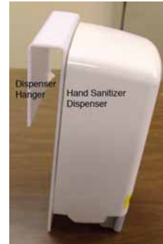
Dispenser with Attached Mounting Bracket