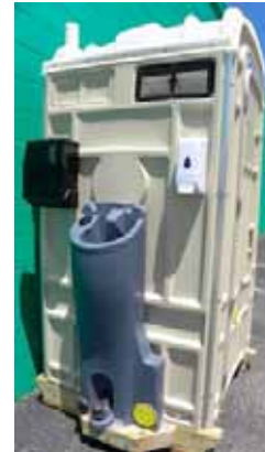
SJHD 45 ES External Sink