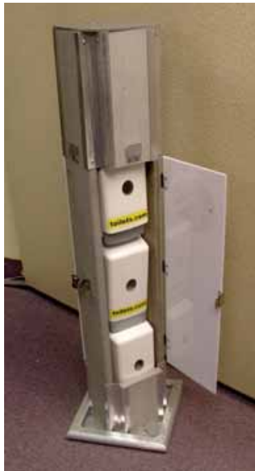
On Site Storage for Four Dispensers