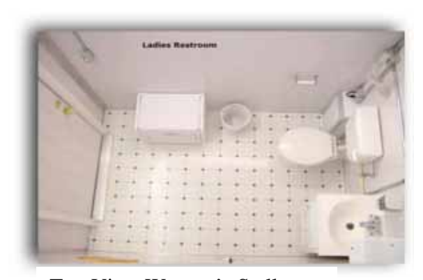
Top View Women's Stall