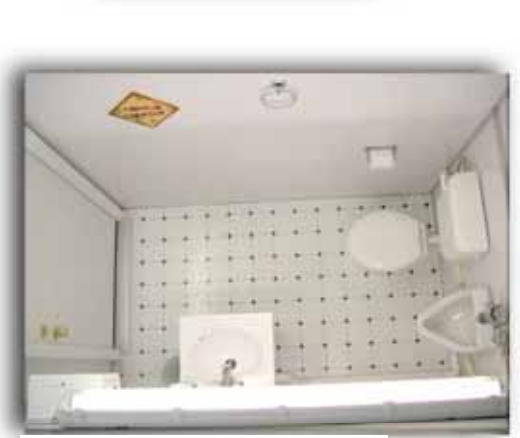
Top View Men's Stall