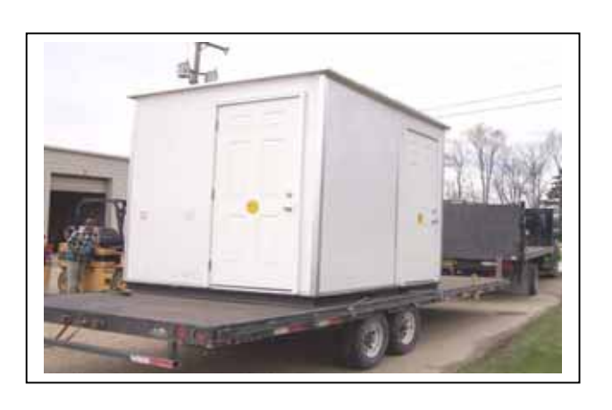
Fig. 4 Loaded on Trailer