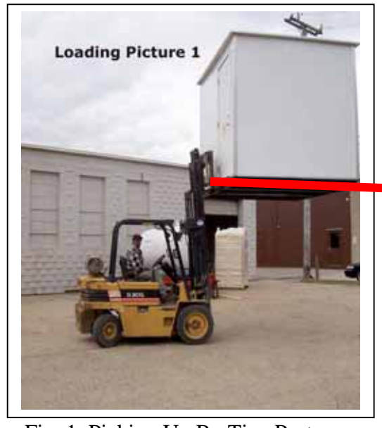
Fig. 1 Picking Up By Tine Ports