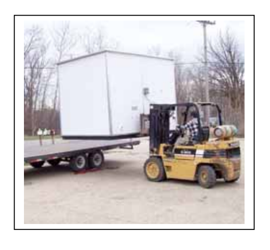
Fig. 3 Preparing To Ship