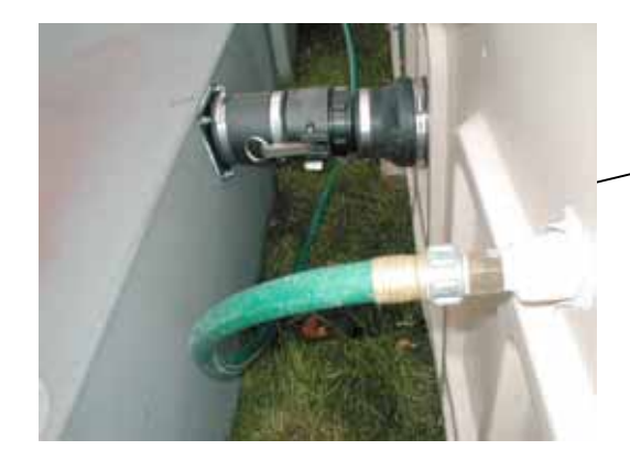
Holding Tank & Garden Hose